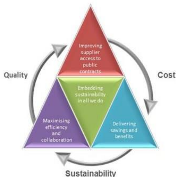
Scottish Model of Procurement